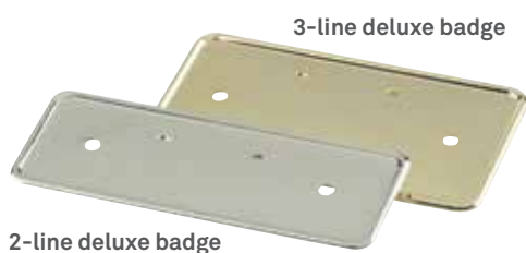
3-line deluxe badge